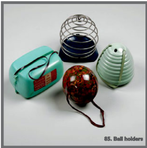
85. Ball holders