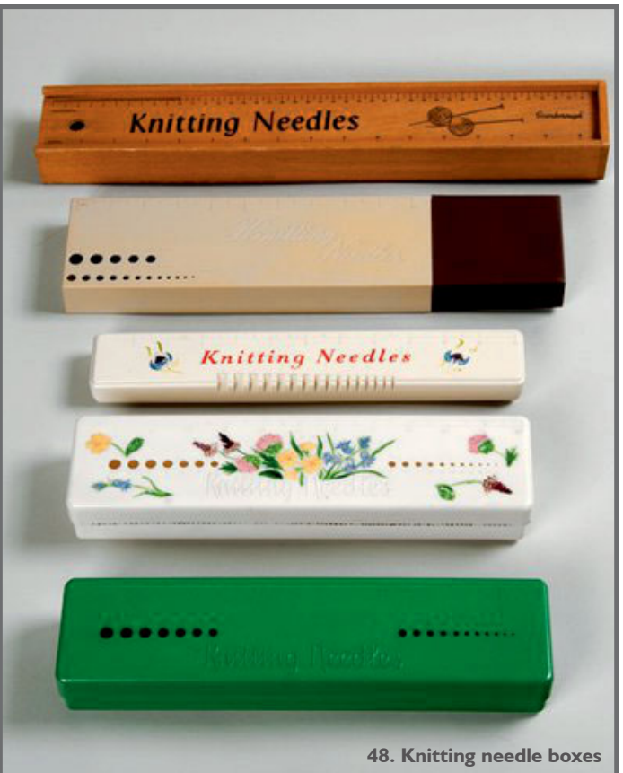
48. Knitting needle boxes