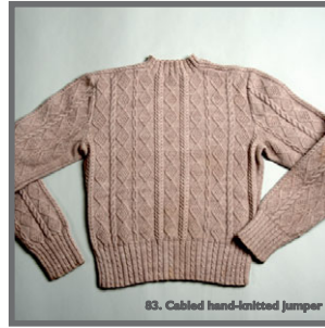
83. Cabled hand-knitted jumper