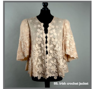
88. Irish crochet jacket