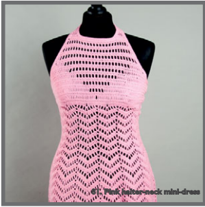
81. Pink halter-neck mini-dress