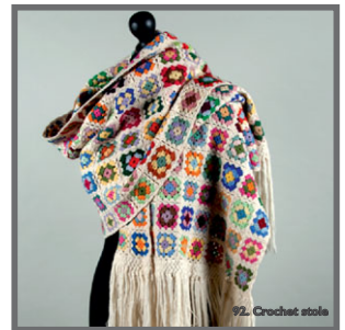
92. Crochet stole