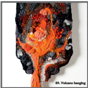
89. Volcano hanging