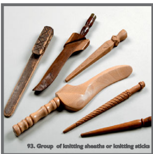
93. Group of knitting sheaths or knitting sticks