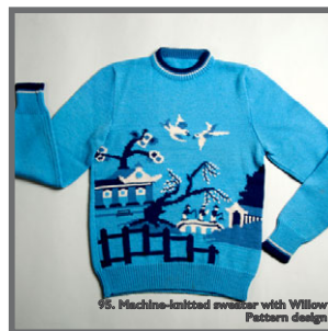
95. Machine-knitted sweater with Willow Patterns design