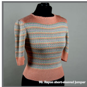
90. Rayon short-sleeved jumper