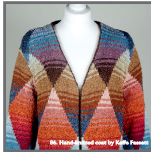
86. Hand-knitted coat by Kaffe Fassett