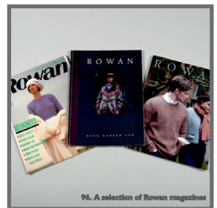
96. A selection of Rowan magazines