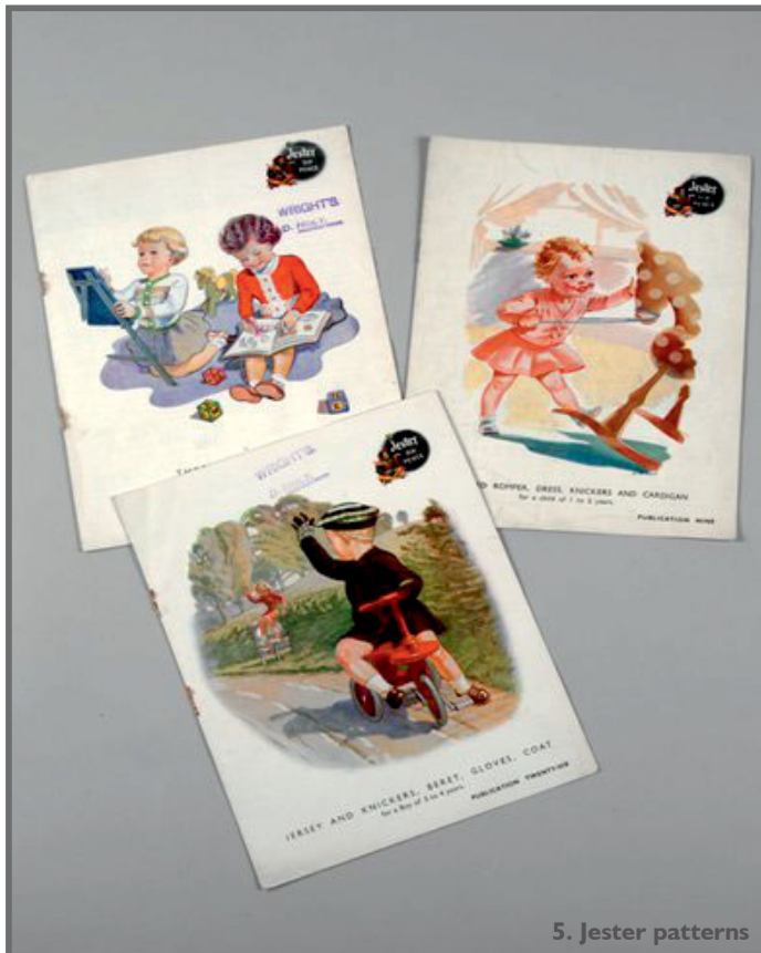
5. Jester patterns