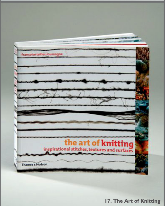
17. The Art of Knitting

100 objects Part of the Collection of the Knitting & Crochet Guild