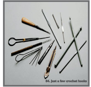
84. Just a few crochet hooks