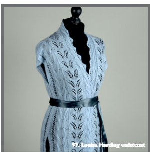
97. Louise Harding waistcoat