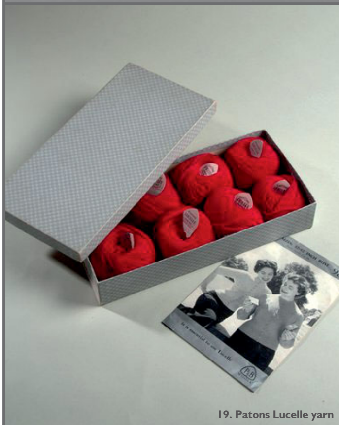
19. Patons Lucelle yarn