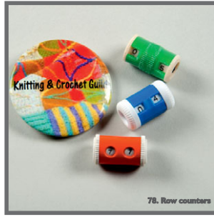
78. Row counters