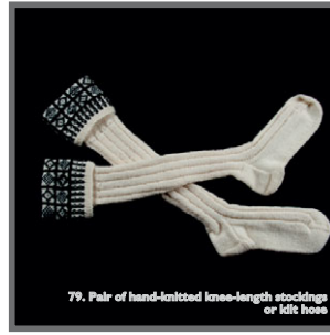
79. Pair of hand-knitted knee-length stockings or kids hose