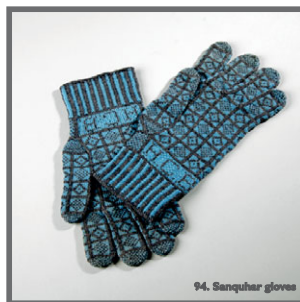
94. Sanquhar gloves