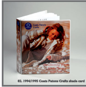
82. 1994/1995 Coats Patons Crafts shade card