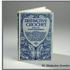
87. Distinctive Crochet