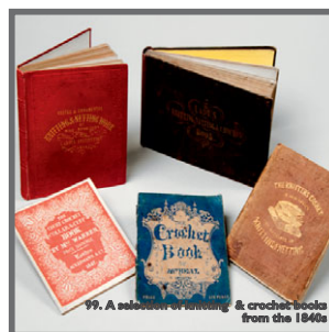
99. A selection of vintage knitting & crochet books from the 1840s