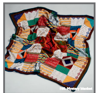
100. Mystery blanket