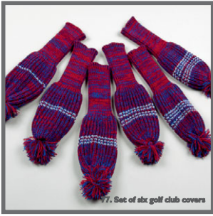
77. Set of six golf club covers