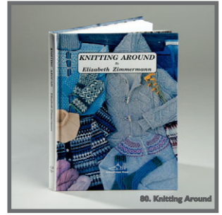
80. Knitting Around