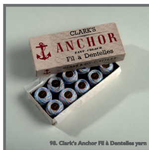
98. Clark's Anchor Fil à Dentelles yarn