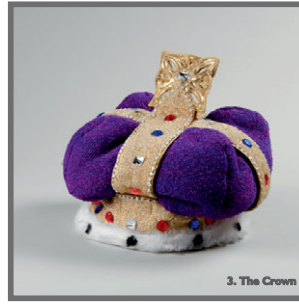
3. The Crown