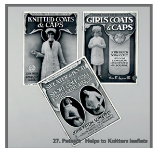
27. Patons' Helps to Knitters leaflets