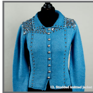
12. Straggled knitted jacket