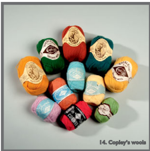
14. Copley's wools