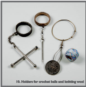
10. Holders for crochet balls and knitting wool