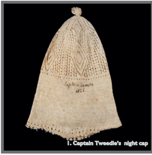
1. Captain Tweedie's night cap