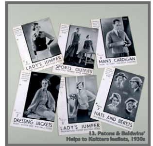
13. Patons & Baldwins' Helps to Knitters leaflets, 1930s