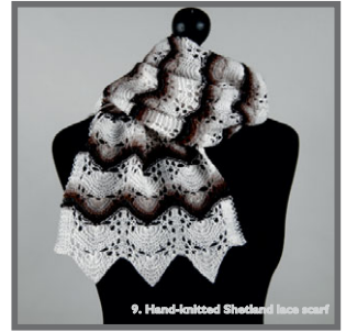
9. Hand-knitted Shetland lace scarf