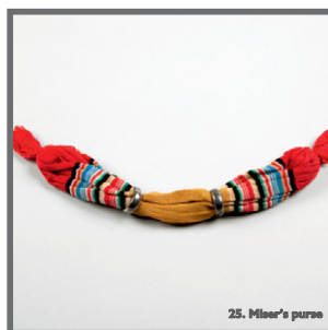
25. Miser's purse