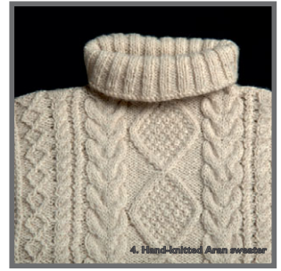
4. Hand-knitted Aran sweater