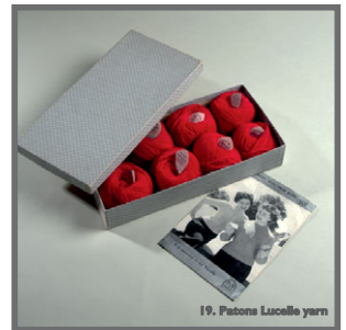
19. Patons Luscillo yarn