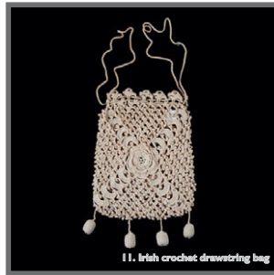
11. Irish crochet drawstring bag