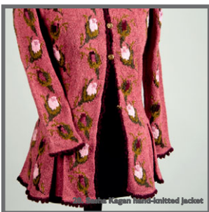
20. Megan hand-knitted jacket