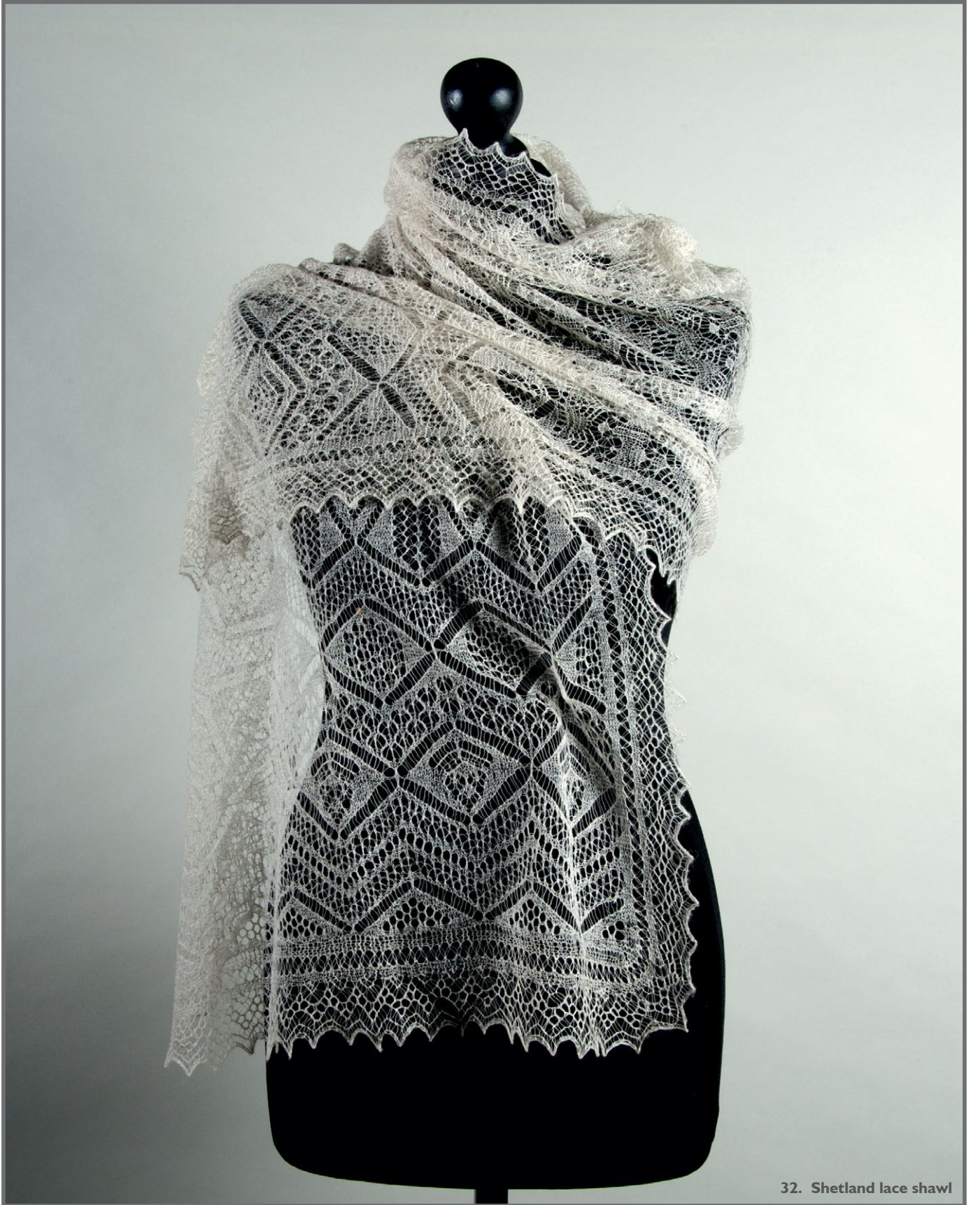
32. Shetland lace shawl

100 objects Part of the Collection of the Knitting & Crochet Guild