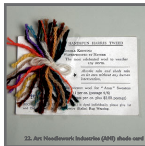
22. Art Needlework Industries (ANI) shade card