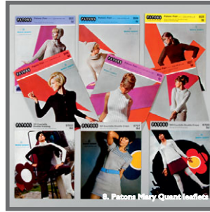
8. Patons Navy Queen leaflets