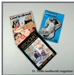
21. 1930s needlecraft magazines