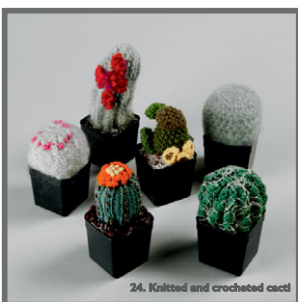
24. Knitted and crocheted cacti