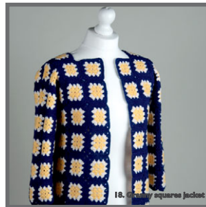
18. Blue squares jacket