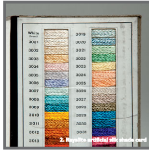
2. Rayon artificial silk shade card