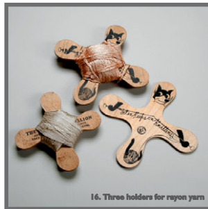
16. Three holders for rayon yarn