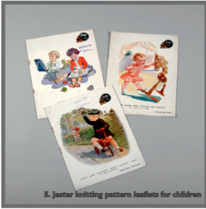
5. Junior knitting pattern leaflets for children